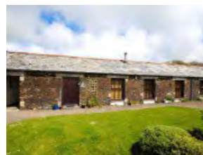
Crackington Haven £177,500