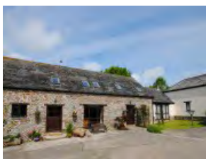
Broad Langdon £539,950

Telephone: 01288 353661 Fax: 01288 359392 Email: bude@webbers.co.uk