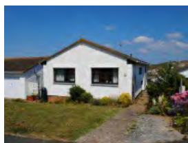
Widemouth Bay £295,000