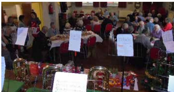
Thank you to all the cooks, waiters and waitresses. It was the best .