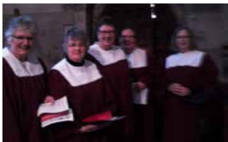
The entrance of the Choir for Jacobstow Church Christmas Sunday Service