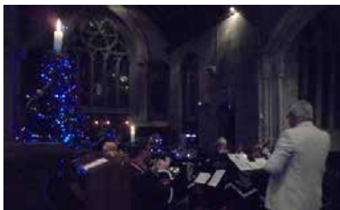
The Crib at the Carol Service with St Gennys Silver Band and excellent supper after