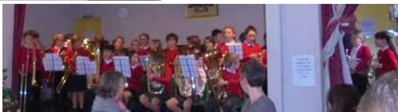
Jacobstow School band entertain at the Friends of Jacobstow Christmas Lunch.